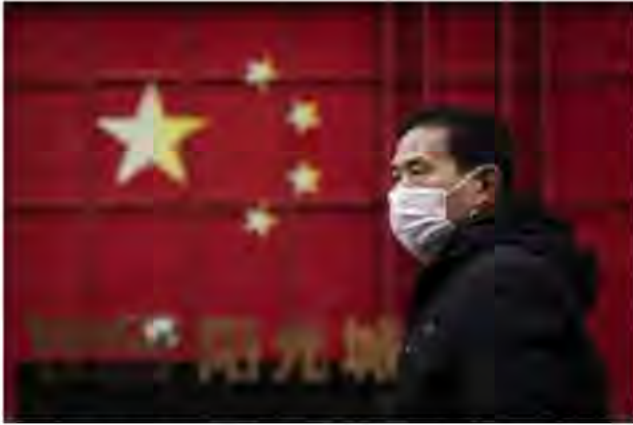
A man wears a protective mask while walking in Wuhan, China, on Feb. 10.